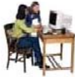
Study Communication Tools