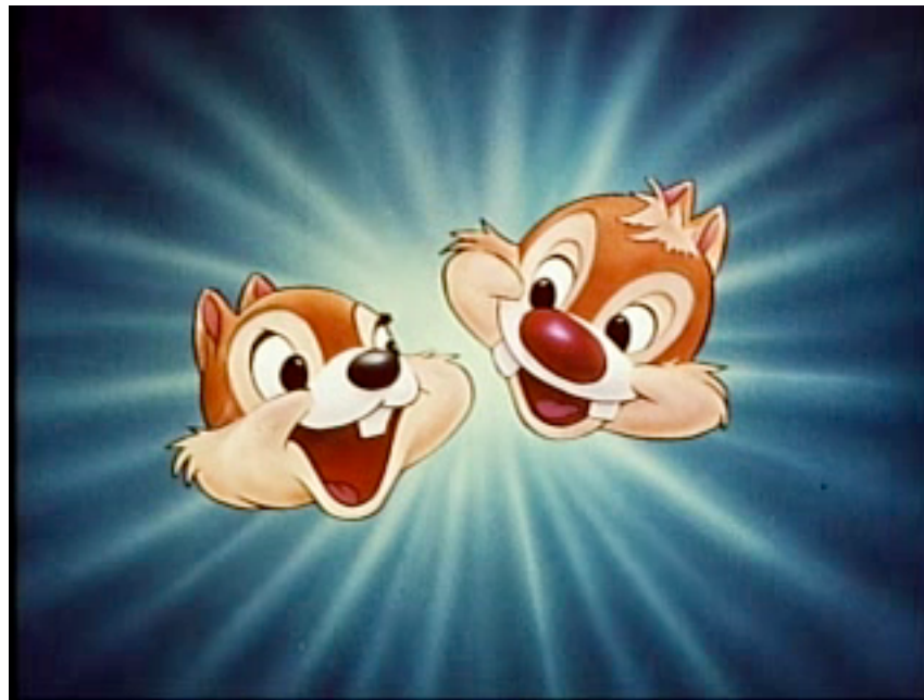
Two Chips and a Miss (1951)