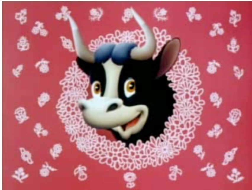
Ferdinand the Bull (1938)

Taking the bull by the horns (LOL!) - Is there a gay subtext to classic Disney?